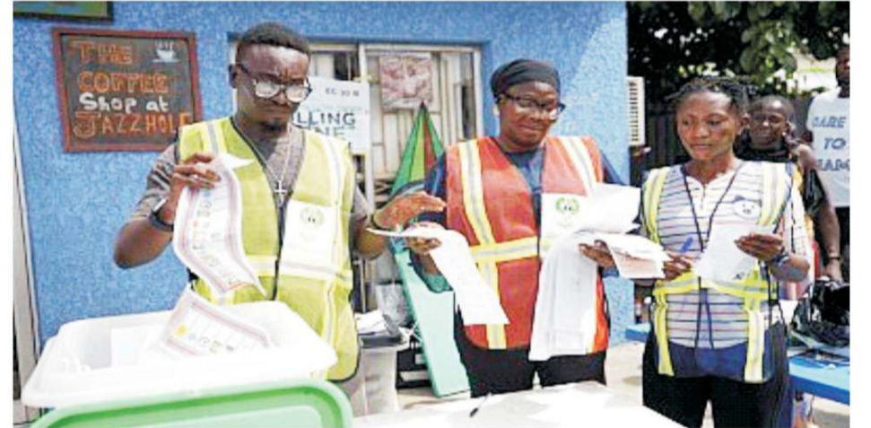
Officials count ballots in front of agents and observers at a polling station in...

Nigeria's ruling APC party has won a majority of governorships, including in the powerful city of Lagos, after more than two-thirds of the votes were counted in local elections held in the wake of the presidential election and marred by violence and irregularities.