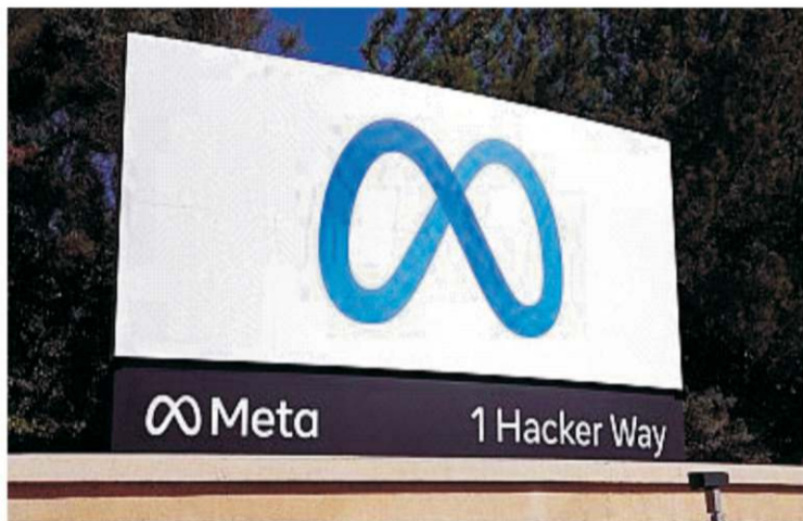
FILE - Facebook's Meta logo sign is seen at the company headquarters in Menlo Park,...

A group of 43 Facebook moderators fired in January have announced they are filing a lawsuit in Kenya against the social network's parent company Meta for, among other things, "unlawful dismissal," according to a statement released Monday.