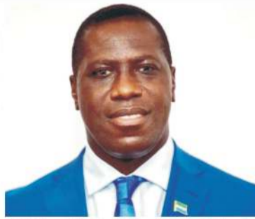
Minister of Foreign Affairs, Prof. David Francis

Sierra Leone Parliament cements bilateral ties with Qatar