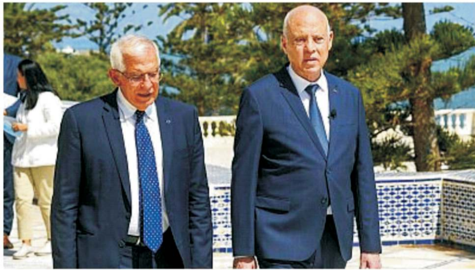
Tunisian President Kais Saied walks with European Union foreign policy chief ....

The European Union is concerned about the deterioration of the political and economic situation in Tunisia and fears a collapse of the country, declared Monday the head of European diplomacy Josep Borrell.