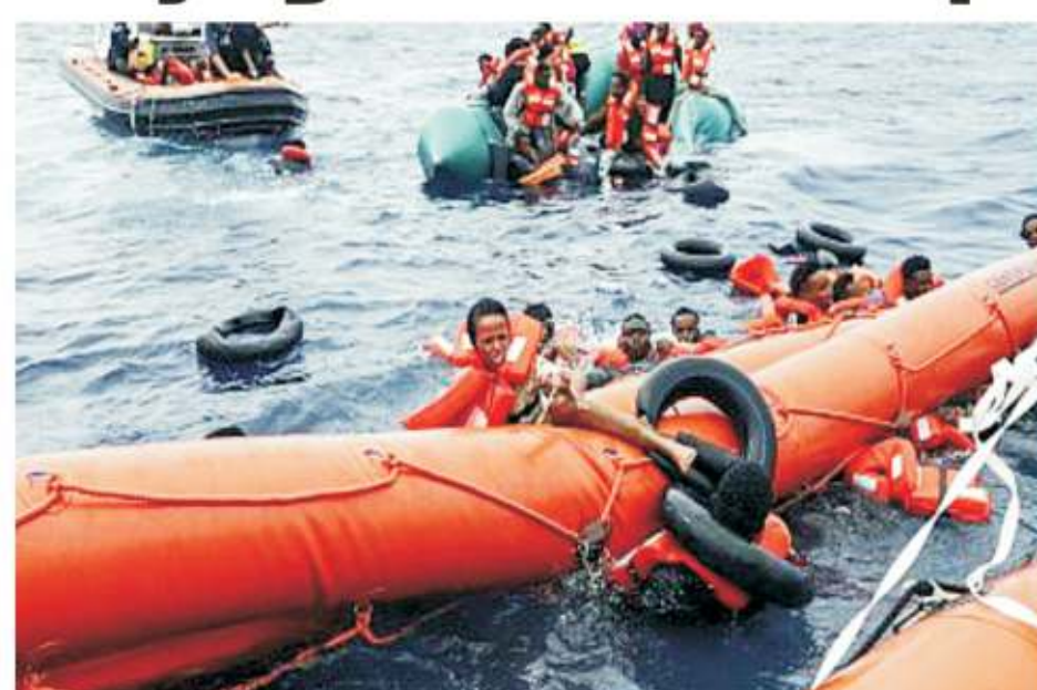
FILE - Migrants aboard a rubber boat end up in the water while others cling on to a centifloat...

Pushbacks are unlawful under international and European Union law, as they violate the right to seek asylum