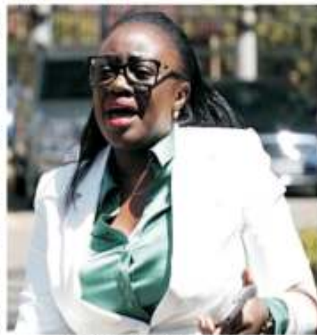
Kenyan minister Gloria Orwoba

Outside the chambers, Senator Orwoba confirmed the report to journalists saying "unfortunately I have been kicked out because I'm on my period and we are not supposed to show our period when we are on our period and that is the kind of period stigma girls and women are having outside..."