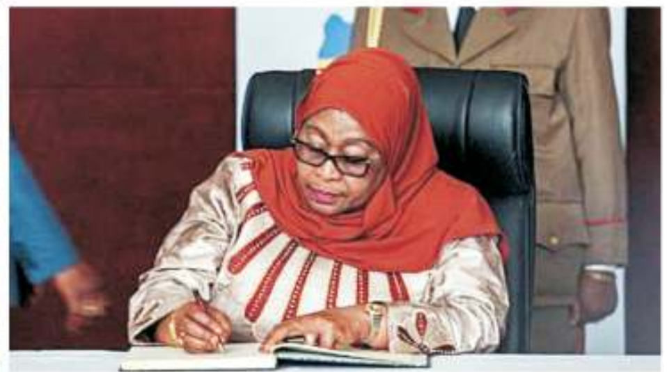
President of Tanzania Samia Suluhu Hassan signs a book upon arrival during the extraordinary Summit of East African Community Heads of State in Burundi

The Tanzanian government has banned from schools several children's books on sex education, accused of contravening "cultural and moral standards" in this East African country where homosexuality is criminalized.