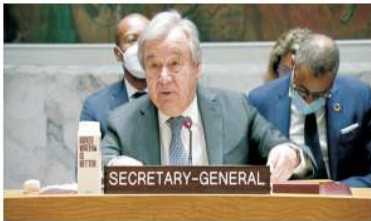
Antonio Guterres, UN secretary-general

The UN's Intergovernmental Panel on Climate Change (IPCC) says sea levels rose by 15-25 centimeters (6-10 inches) between 1900 and 2018. If the world warms by just two degrees Celsius (3.6 degrees Fahrenheit) compared to the pre-industrial era, then those levels will rise again by 43 centimeters by the year 2100.