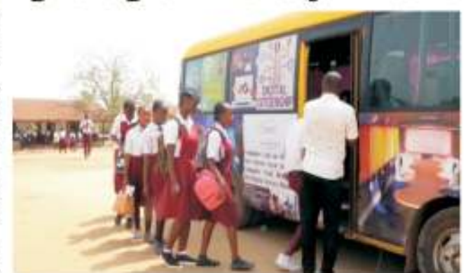
New Breed Tech Hub start-up bus teaches digital skills to schoolchildren in northern Liberia

"For each time we reach this new community, the momentum is high. Students are eager, they want to