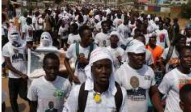
Opposition activists demonstrate against President George Weah in a suburb of Monrovia

Hundreds of Liberians gathered on Saturday in a suburb of Monrovia to demonstrate against the President George Weah.