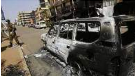
File photo from Jan. 17, 2016: a soldier stands in front of a burned car in front of the ...

These attacks by groups linked to the Islamic State and al-