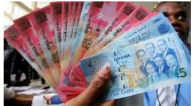
A woman holds a bundle of cedis in Accra on July 3, 2007

Ghana has temporarily suspended the payment of part of its external debt, including Eurobonds, as it seeks to restructure it after an agreement with the International Monetary Fund (IMF) last week.