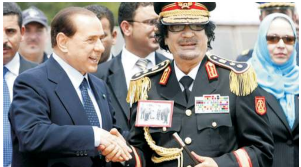
Libyan leader Moammar Gadhafi (R) is greeted by Italian Premier Silvio Berlusconi upon his arrival at Rome in June, 2009. He wore a picture of anti-colonial hero O. Al-Mukhtar.