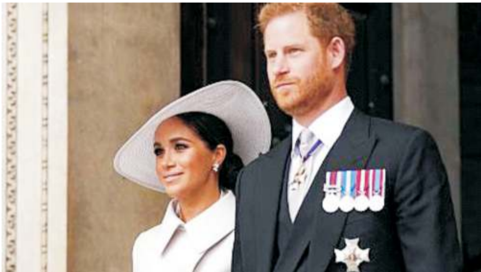
Prince Harry and Meghan Markle, Duke and Duchess of Sussex leave after a service of...

Meghan Markle and Prince Harry Foundation has donated an unspecified amount to charities working in Nigeria to 'help provide relief following devastating flooding' that has ravaged parts of Nigeria. This is coming after Duchess Sussex, 41, revealed she is 43 percent Nigerian after doing a genealogy test a couple of years ago. She said this in her latest Archetypes Podcast series released on Tuesday. In a press release that accompanied the episode, a Spotify representative confirmed that the couple's Archewell Foundation made donations to Save the Children and UNICEF. The devastating floods have been blamed on heavy