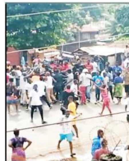
Photo showing protesters beating OSD officer in Freetown during the protest

In the initial stage of the protest, social media footages emerged, showing the protesters blocking roads, burning tires, raging at police officers and torturing them