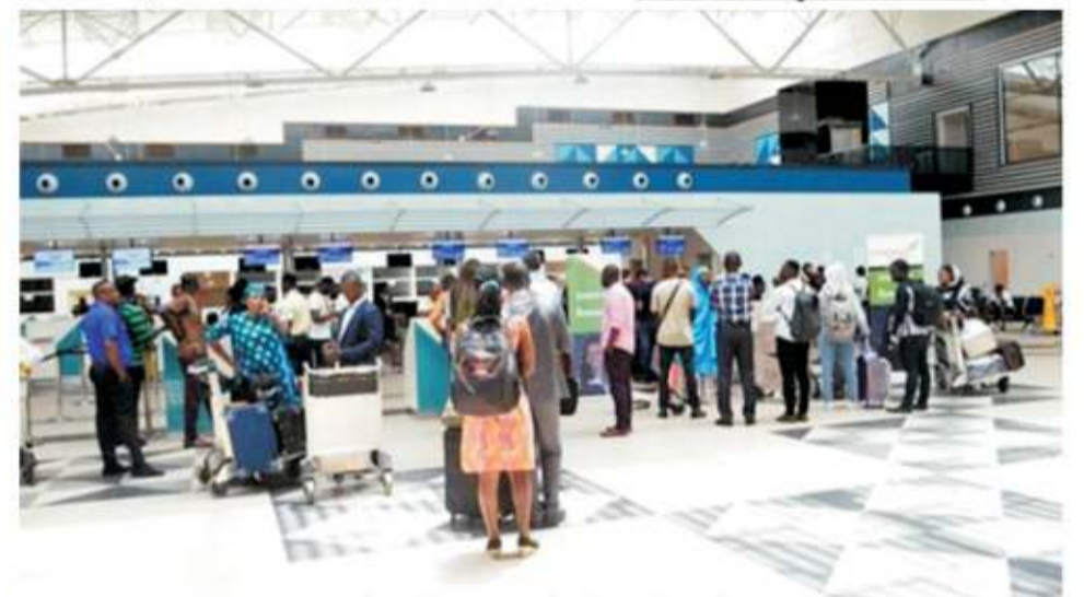
Passengers heading to United Arab Emirates (UAE)

I t has been made clear that the United Arab Emirates (UAE) has not issued any visa ban on Sierra Leoneans trying to enter the country for business purposes, according to a press release issued by the Sierra Leone Embassy in the United Arab Emirates.