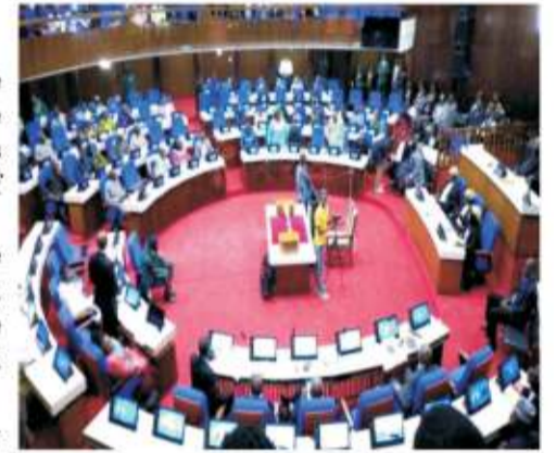
The Parliament of Sierra Leone

"MPs will be allowed to take the tablets away with them as personal properties when leaving their seats in Parliament.