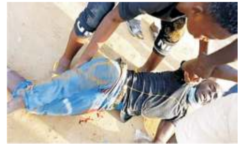
An anti-government demonstrator lays on the ground after being wounded during ...

HRW said it was "unable to confirm" the deaths of law