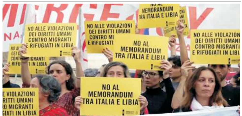
cleared cleared