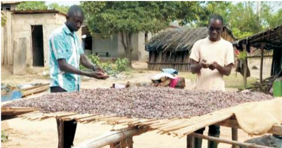
Cocoa producers

The world's top cocoa producers, Ghana and Ivory Coast, are boycotting meetings in Brussels of the World Cocoa Foundation on cocoa sustainability this Wednesday and Thursday (October 26 and 27). Authorities in the two West African countries accuse multinational chocolate companies and traders of blocking measures to improve cocoa farmers' incomes. Ghana and Ivory coast's grievances concern the Living Income Differential (LID) set at a standard of $400 per tonne and charged on top of world prices. The LID was introduced in 2019 to guarantee cocoa farmers a minimum price that would improve the income of farmers, many of whom live in poverty. But commodity traders set a negative differential for the two nations at 260 dollars per tonne.