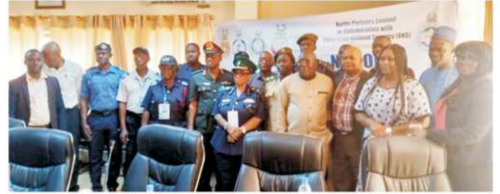
The Security sectors and members of the ONS

He further that, the motive was for officers in all sectors in the security to feel proud of the work they are doing for the country.